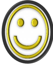
Your name here